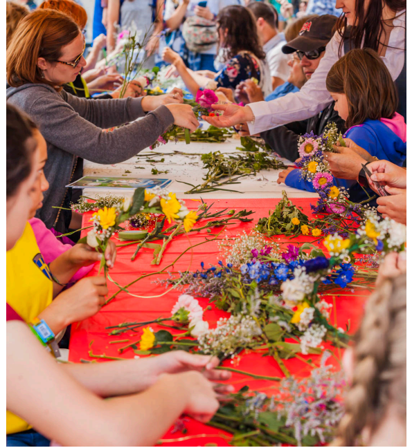
Making flower crowns is a favorite festival tradition.