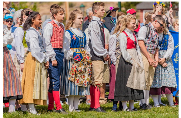
Lindsborg Folkdanslag Junior Dancers.